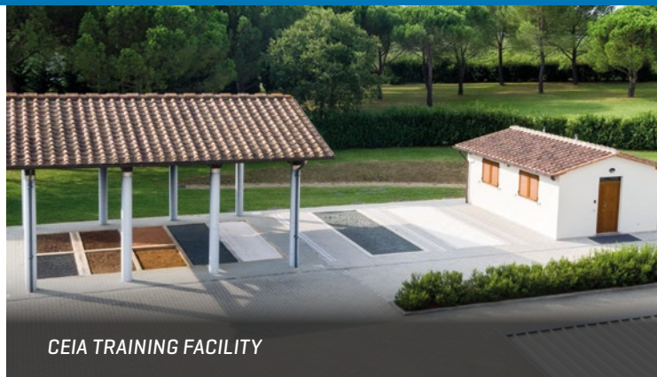
CEIA TRAINING FACILITY