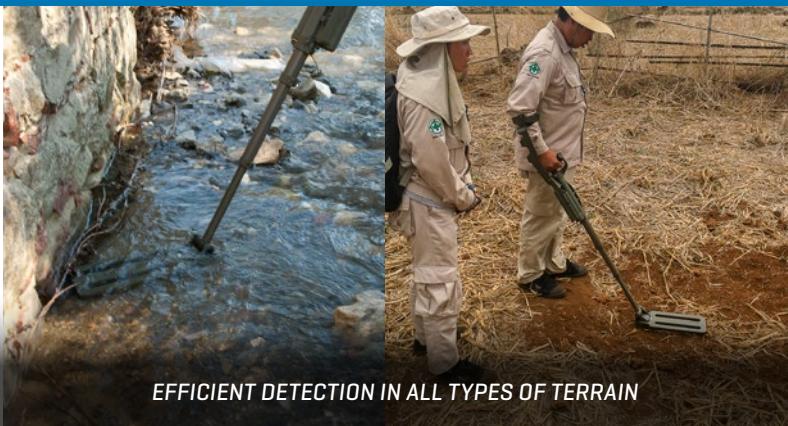
EFFICIENT DETECTION IN ALL TYPES OF TERRAIN